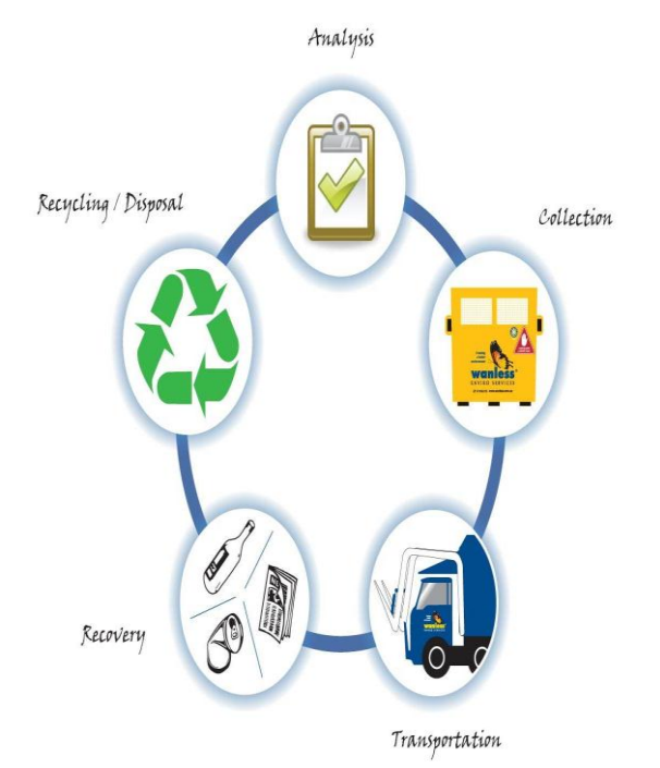
Fig. 2: Connection between collection, transportation, recovery, recycling and analysis

INTERNATIONAL JOURNAL OF INNOVATIVE RESEARCH IN ELECTRICAL, ELECTRONICS, INSTRUMENTATION AND CONTROL ENGINEERING Vol. 3. Issue 6. June 2015