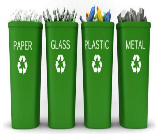
Fig. 3: Materials of recycling